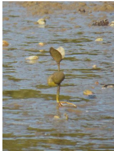
Baby mangrove tree, Waitangi, North Island, New Zealand.

Our worship will be very similar to how we observed Advent, contemplative, quiet and prayerful. We will sing quite a bit of music from Taize during Lent. We will not be saying Alleluia, and we will be saying the Confession. We will try our best to take on a discipline intended to increase our mindfulness and give up something that distracts us. The more focused on our faith and the sacrifice that Jesus has given for us, the more complete our Lenten observances will be. I encourage you to participate as fully as you can this